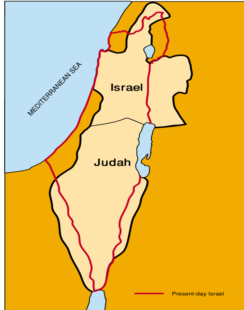
The Divided Kingdom, 10th - 6th Century BCE